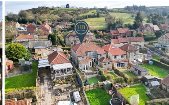
5 ESKDALE CLOSE, SLEIGHTS- 3 bed Semi-Detached House -£350,000