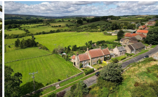
CHURCH VIEW, EGTON- 3 bed Cottage -£345,000