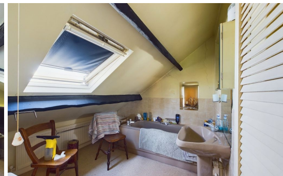
FIELD HOUSE, ELLERBY- 3 bed Detached House -£350,000