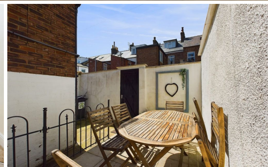
LAVENDER HOUSE, 6 PARK TERRACE, WHITBY- 4 bed Town House -£385,000