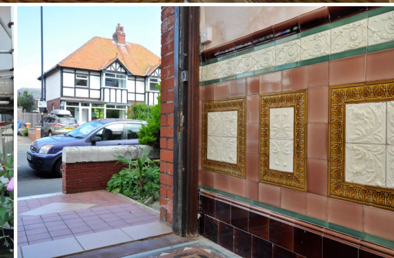
FLAT 4, 24 CRESCENT AVENUE - 1 bed Flat - £95,000