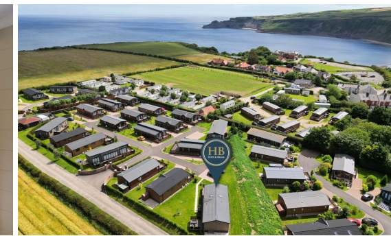
14 THE PINES, RUNSWICK- 3 bed Lodge -£235,000