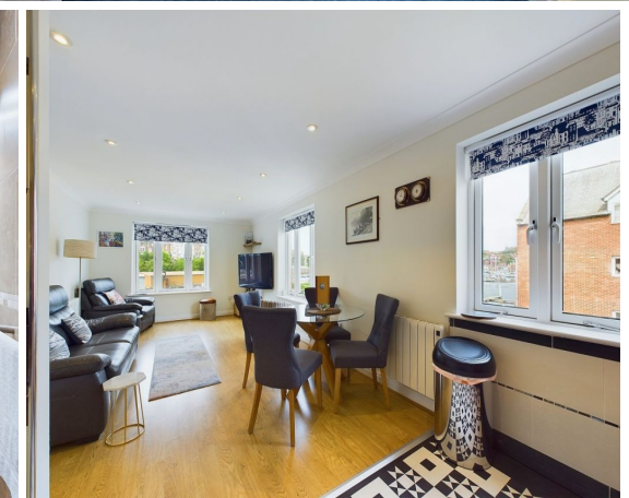
15 HOLT COURT, WHITEHALL LANDING- 2 bed Apartment -£298,000