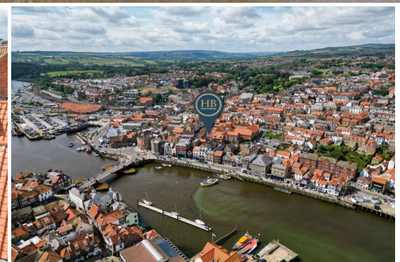
CAROL'S COTTAGE, 49 FLOWERGATE - 2 bed Maisonette - £285,000