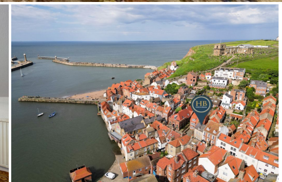
100 CHURCH STREET, WHITBY - 5 bed Town House - £300,000