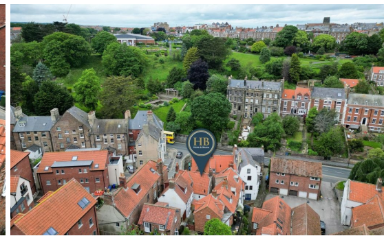
HERRING COTTAGE, 9 CARRS YARD, WHITBY- 2 bed Cottage -£225,000