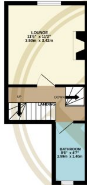
1ST FLOOR 218 sq.ft. (20.2 sq.m.) approx.