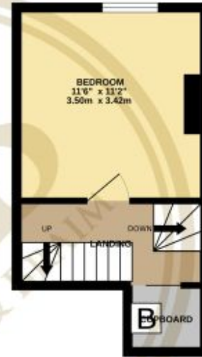
2ND FLOOR 205 sq.ft. (18.9 sq.m.) approx.