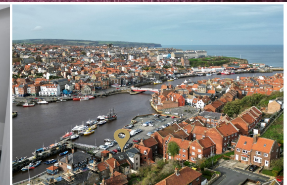
SAILORS COTTAGE, 48 CHURCH STREET - 2 bed Cottage - £259,950