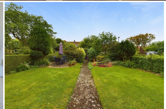
6 ELM GROVE, ROBIN HOODS BAY - 5 bed Terraced House - £495,000