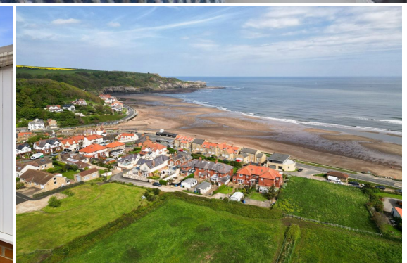
RIDGEWOOD, SANDSEND - 4 bed End of Terrace House - £775,000