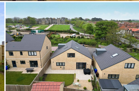
18 CLAREMONT DRIVE, WHITBY - 3 bed Detached Bungalow - £425,000