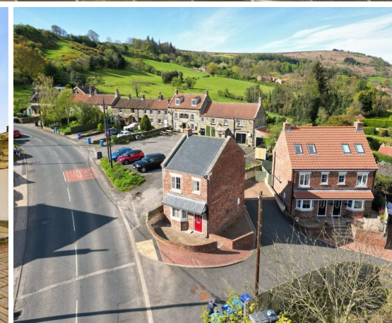
1 OLD SCHOOL GARDENS, SLEIGHTS- 2 bed Detached House -£215,000