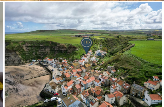
HILLSOVER, STAITHES - 2 bed Cottage - £375,000