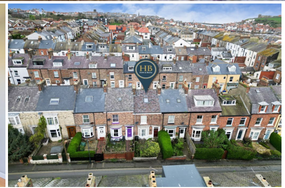
6 YORK TERRACE, WHITBY - 4 bed Terraced House - £180,000