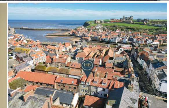
2 BURNS YARD, FLOWERGATE - 2 bed Cottage - £189,950