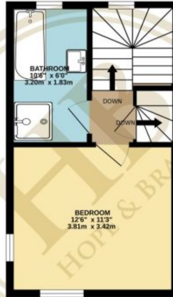
1ST FLOOR 271 sq.ft. (25.2 sq.m.) approx.