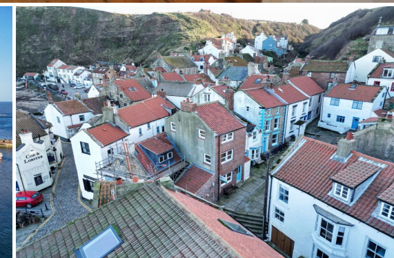
SEA HAVEN, 1 BARRAS SQUARE, STAITHES - 2 bed Cottage - £325,000