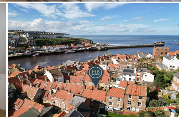
WHALERS COTTAGE, BLACKBURNS YARD - 2 bed Cottage - £279,950