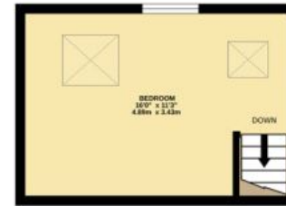
2ND FLOOR 181 sq.ft. (16.8 sq.m.) approx.