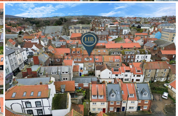
4 OYSTONS YARD, WHITBY - 2 bed Cottage - £250,000