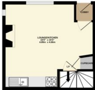
GROUND FLOOR 239 sq.ft. (22.2 sq.m.) approx.