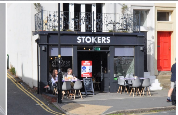
1 MULGRAVE PLACE, WHITBY - 6 bed Town House - £750,000