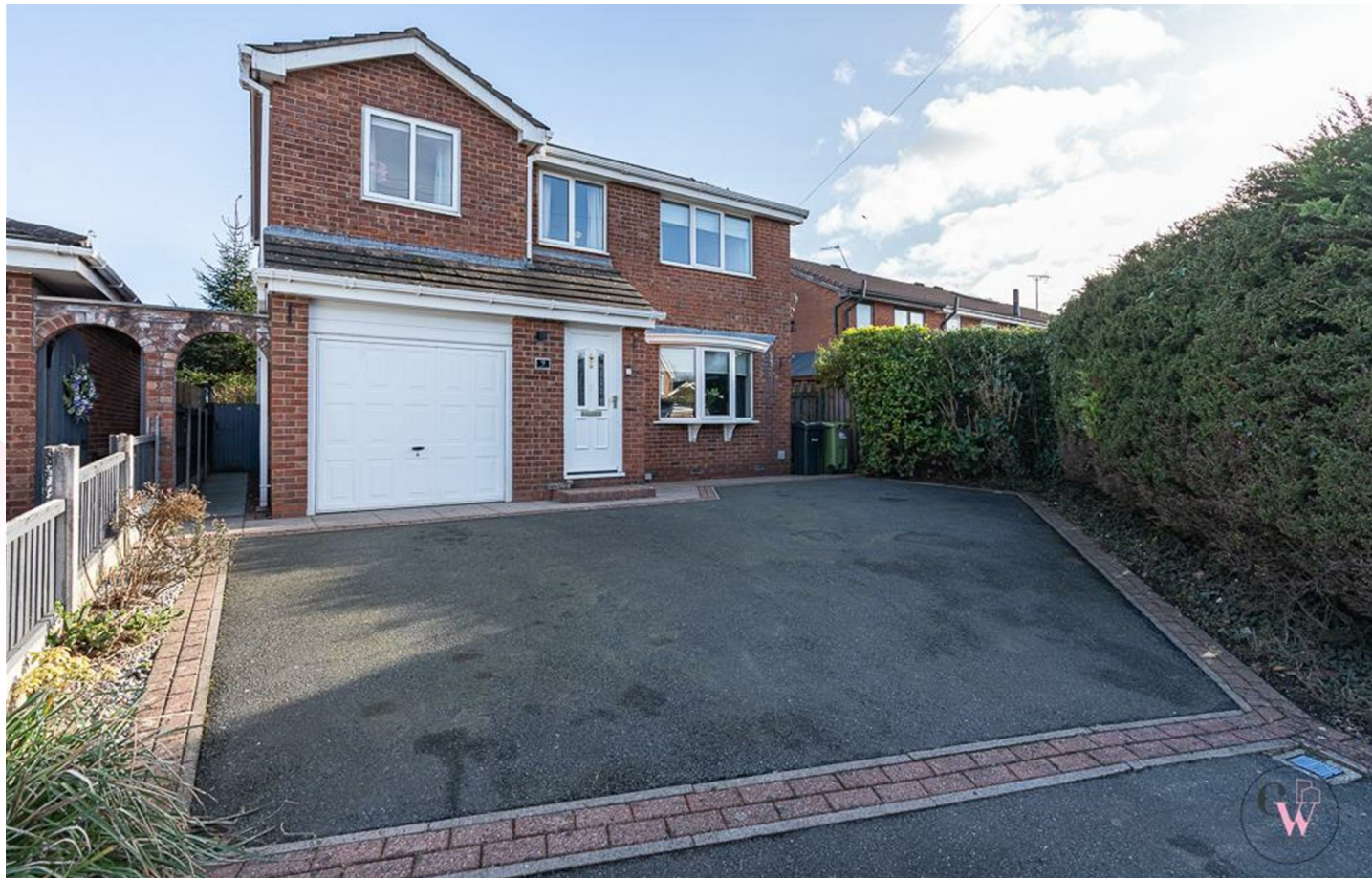
Cartmel Close, Winsford CW7 2DN