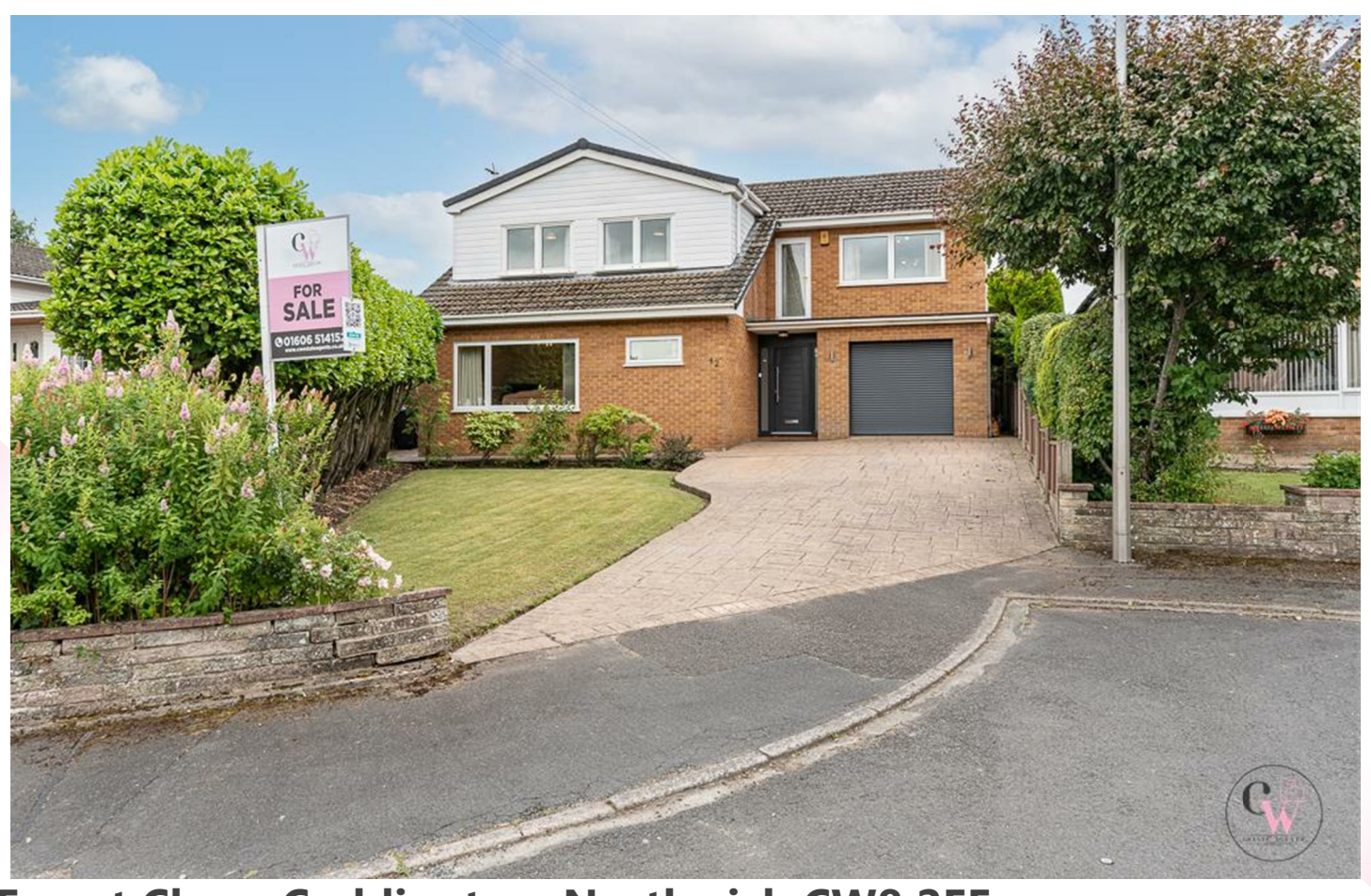
Forest Close, Cuddington, Northwich CW8 2EE