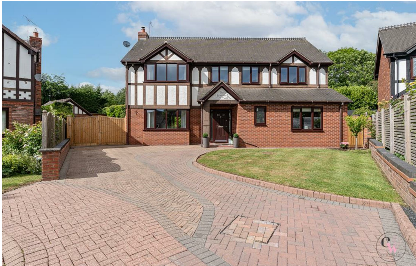
Hareswood Close, Winsford CW7 2TP