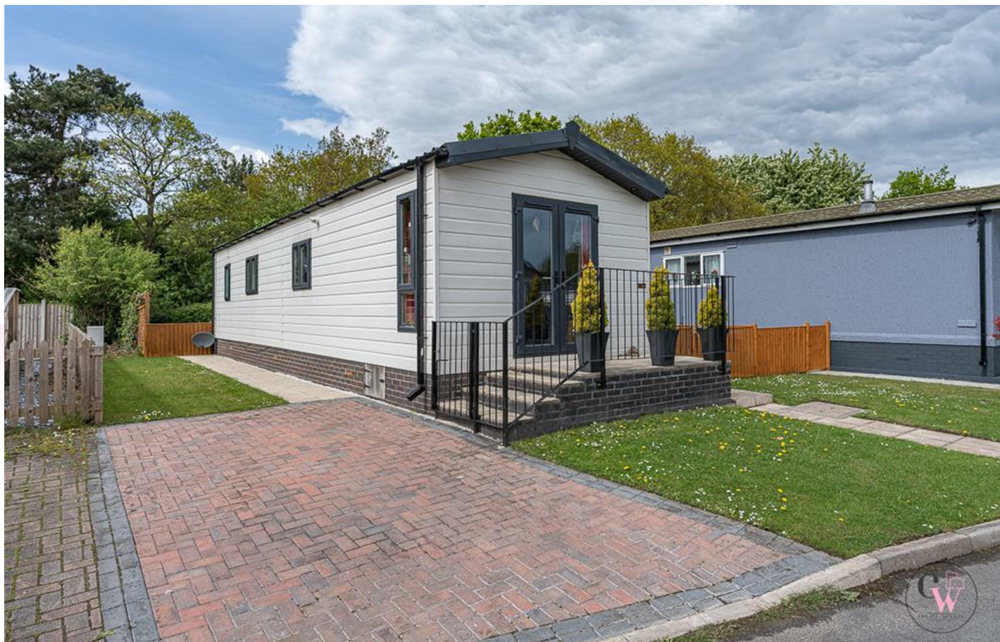
Lee Green Lane, Church Minshull, Nantwich CW5 6ED