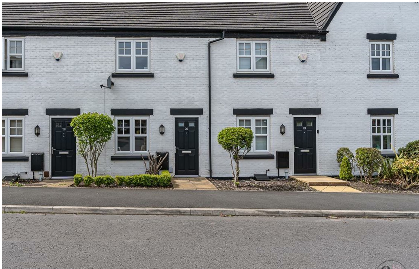
Charter Court, Winsford CW7 2FY