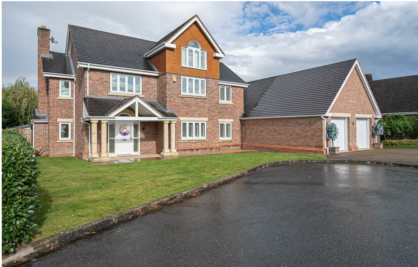
Hampstead Drive, Wychwood Park, Weston CW2 5GT