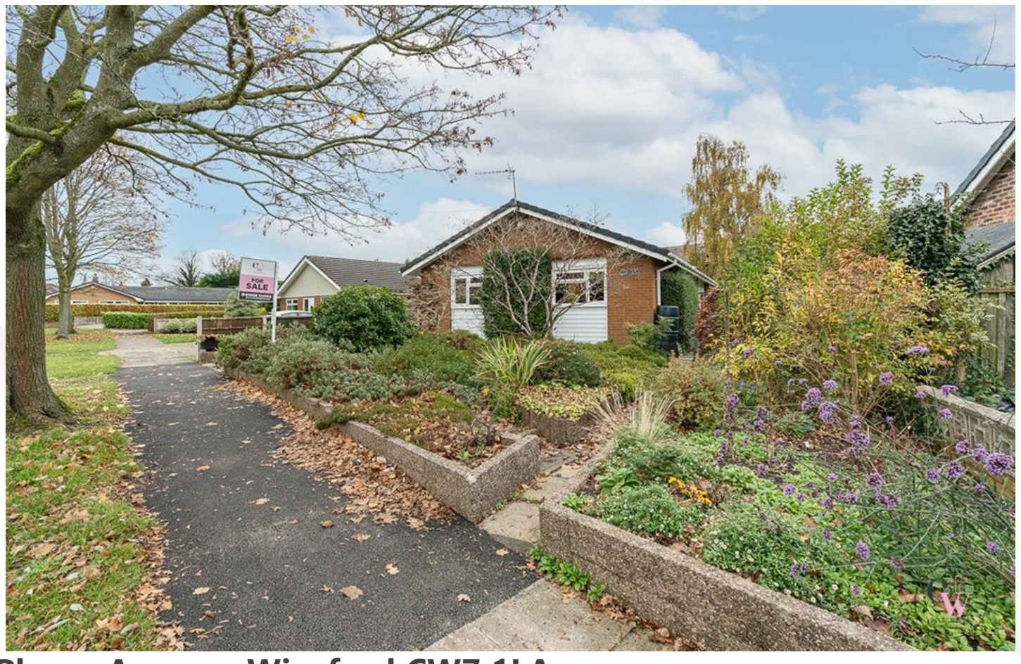
Plover Avenue, Winsford CW7 1LA