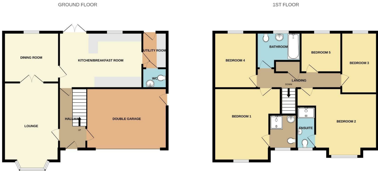
FIVE BEDROOM DETACHED

Whilst every attempt has been made to ensure the accuracy of the floorplan contained here, measurements of doors, windows, rooms and any other items are approximate and no responsibility is taken for any error, omission or mis-statement. This plan is for illustrative purposes only and should be used as such by any prospective purchaser. The services, systems and appliances shown have not been tested and no guarantee as to their operability or efficiency can be given. Made with Metropix ©2024