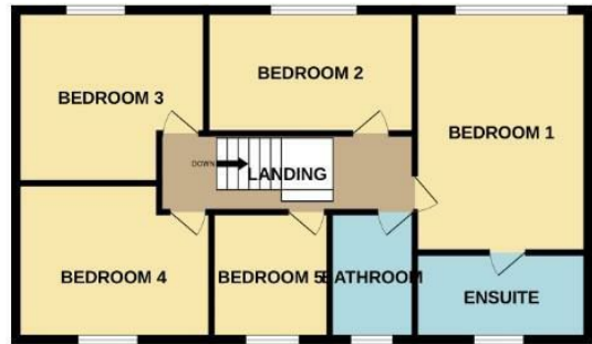
1ST FLOOR 718 sq.ft. (66.7 sq.m.) approx.