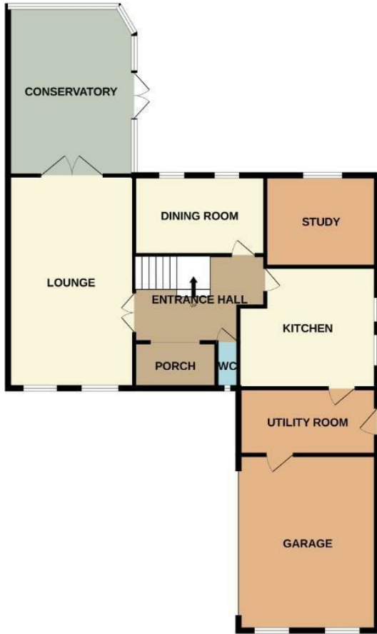
GROUND FLOOR 1218 sq.ft. (113.1 sq.m.) approx.