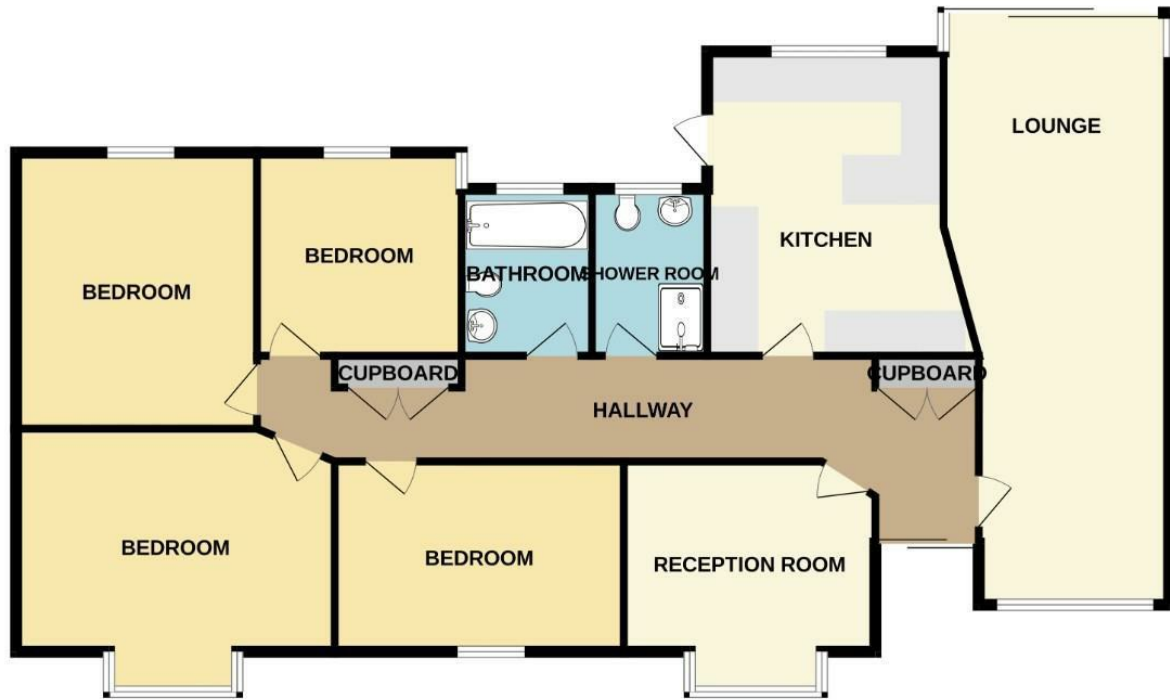
FOUR BEDROOM BUNGALOW

Whilst every attempt has been made to ensure the accuracy of the floorplan contained here, measurements of doors, windows, rooms and any other items are approximate and no responsibility is taken for any error, omission or mis-statement. This plan is for illustrative purposes only and should be used as such by any prospective purchaser. The services, systems and appliances shown have not been tested and no guarantee as to their operability or efficiency can be given. Made with Metropix ©2024