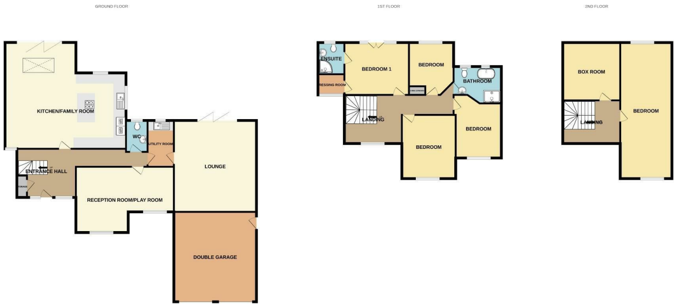
FIVE BEDROOM DETACHED

Whilst every attempt has been made to ensure the accuracy of the floorplan contained here, measurements of doors, windows, rooms and any other items are approximate and no responsibility is taken for any error, omission or mis-statement. This plan is for illustrative purposes only and should be used as such by any prospective purchaser. The services, systems and appliances shown have not been tested and no guarantee as to their operability or efficiency can be given. Made with Metropix ©2023