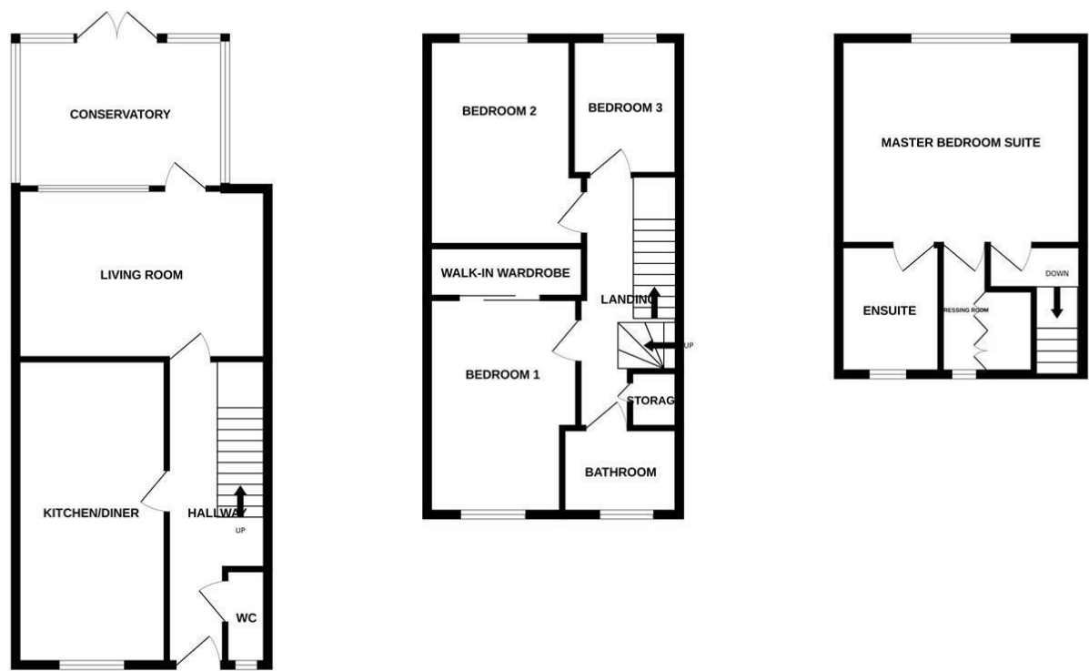
4 BEDROOM HOUSE

Whilst every attempt has been made to ensure the accuracy of the floorplan contained here, measurements of doors, windows, rooms and any other items are approximate and no responsibility is taken for any error, omission or mis-statement. This plan is for illustrative purposes only and should be used as such by any prospective purchaser. The services, systems and appliances shown have not been tested and no guarantee as to their operability or efficiency can be given. Made with Metropix ©2025