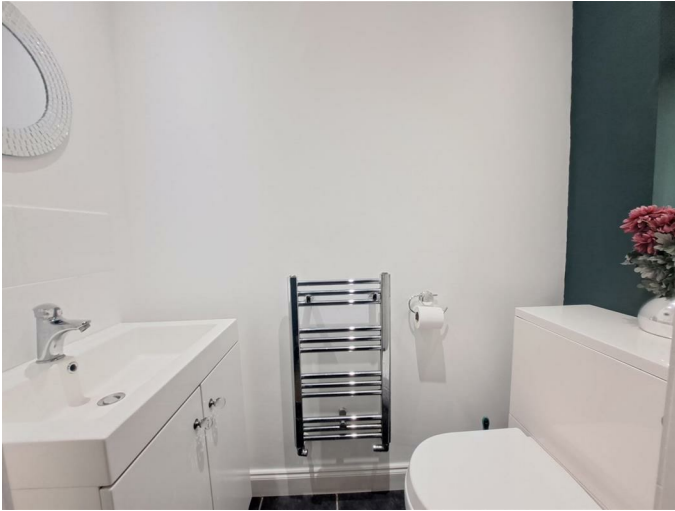
Downstairs WC 5'11 x 2'8 (1.80m x 0.81m)