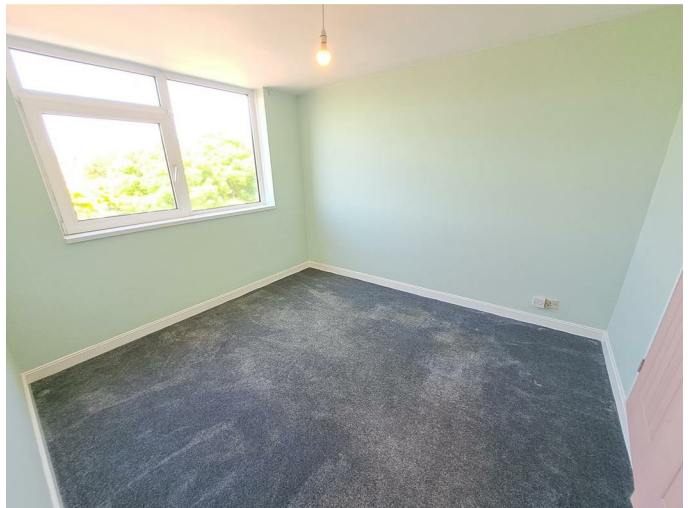
Bedroom Two 10'11 x 9'9 (3.33m x 2.97m)