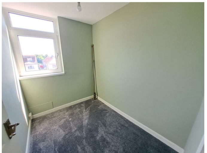
Bedroom Three 7'8 x 5'11 (2.34m x 1.80m)