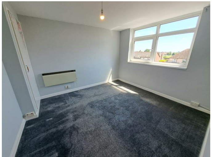
Bedroom One 11'9 x 10'7 (3.58m x 3.23m)