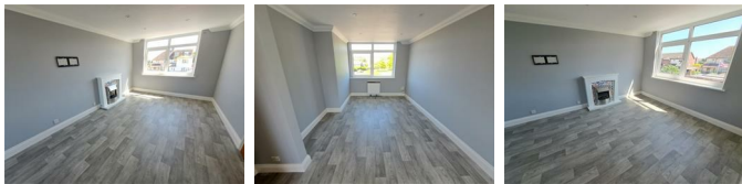
Lounge/Diner 24'10 x 10'7 (7.57m x 3.23m)