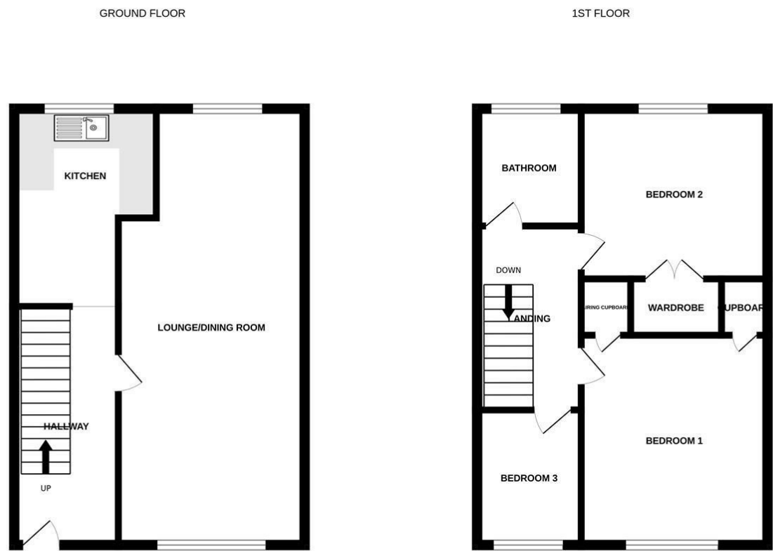
3 BEDROOM PROPERTY

Whilst every attempt has been made to ensure the accuracy of the floorplan contained here, measurements of doors, windows, rooms and any other items are approximate and no responsibility is taken for any error, omission or mis-statement. This plan is for illustrative purposes only and should be used as such by any prospective purchaser. The services, systems and appliances shown have not been tested and no guarantee as to their operability or efficiency can be given. Made with Metropix ©2023