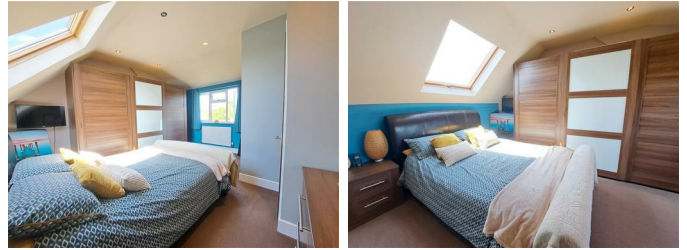
Master Bedroom 15'4 max x 12'11 max (4.67m max x 3.94m max)