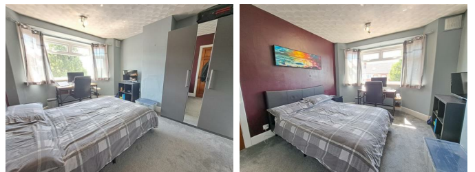
Bedroom Two 12'11 into bay x 11'1 (3.94m into bay x 3.38m)