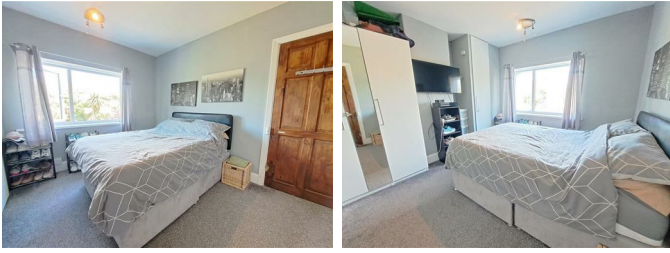
Bedroom Three 10'11 x 11'0 (3.33m x 3.35m)