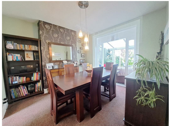
Dining Room 11'11 x 10'6 (3.63m x 3.20m)