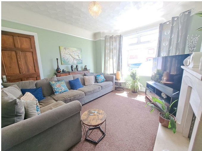
Lounge 12'11 into bay x 11'11 (3.94m into bay x 3.63m)