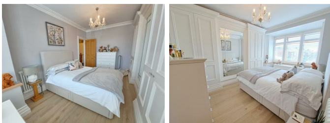
Bedroom One 14'5 x 10'2 (4.39m x 3.10m)