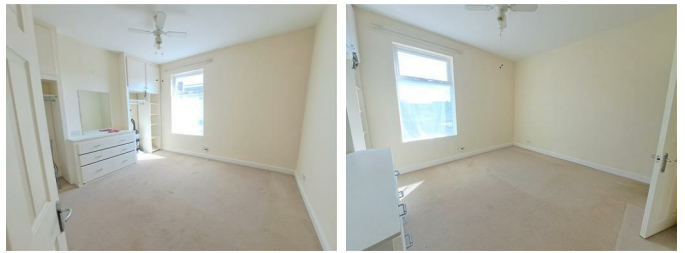
Bedroom Two 10'11 x 9'9 (3.33m x 2.97m)