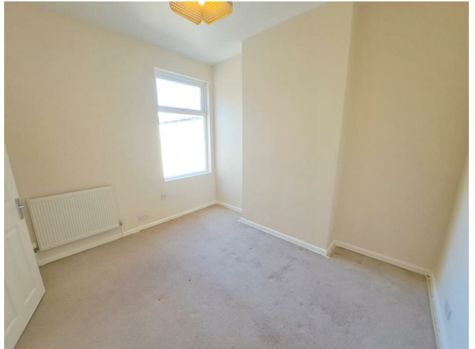
Bedroom Three 11'0 x 8'4 (3.35m x 2.54m)