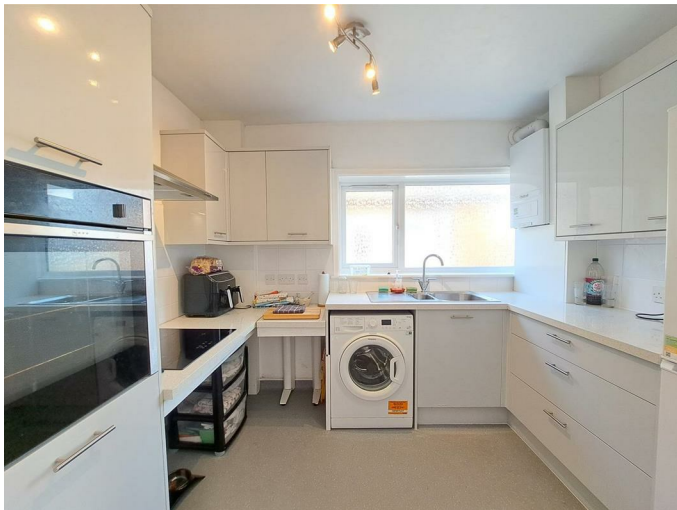
Kitchen 9'10 x 7'3 (3.00m x 2.21m)