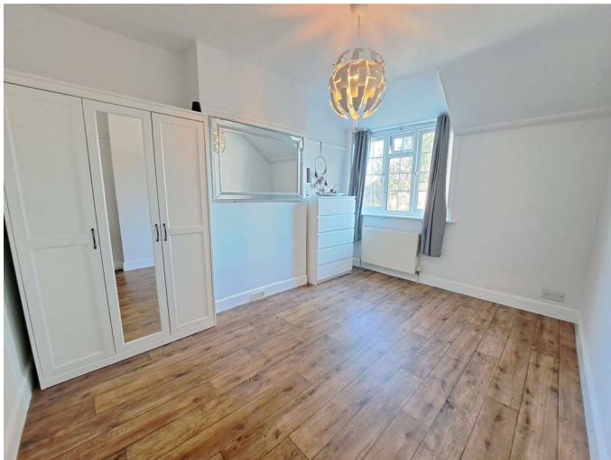
Bedroom Two 12'11 x 9'11 (3.94m x 3.02m)