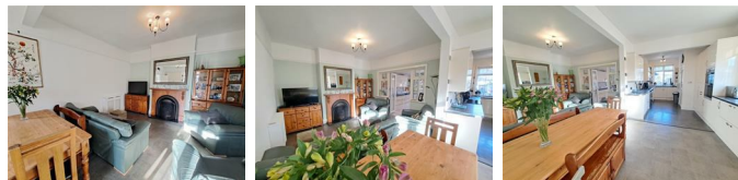
Open Plan Kitchen/Diner/Sitting Room 25'4 max x 22'4 max (7.72m max x 6.81m max)