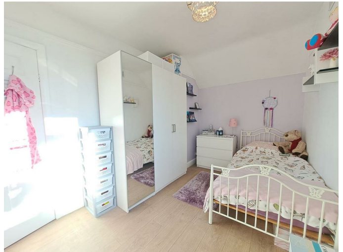
Bedroom Four 13'1 x 8'4 (3.99m x 2.54m)