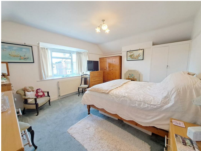
Bedroom One 15'11 x 12'11 (4.85m x 3.94m)