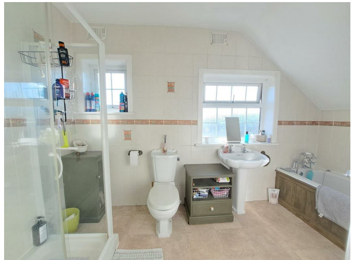
Family Bathroom 12'0 x 5'11 (3.66m x 1.80m)