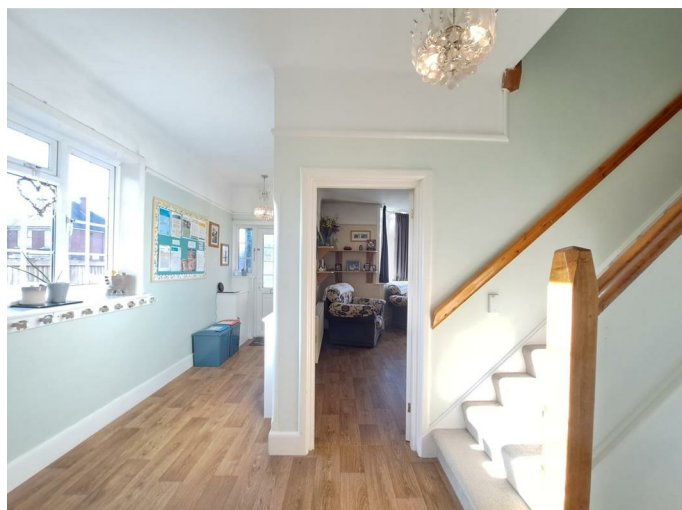
Living Room 16'11 x 15'9 into bay (5.16m x 4.80m into bay)