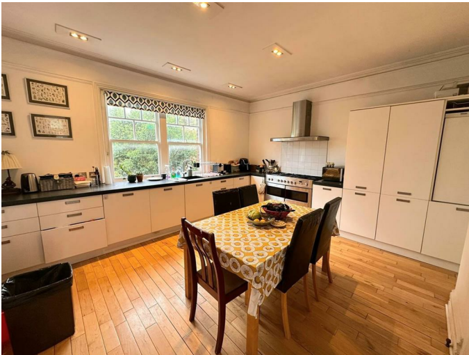
Kitchen/Dining Room 16'1 x 14'1 (4.90m x 4.29m)