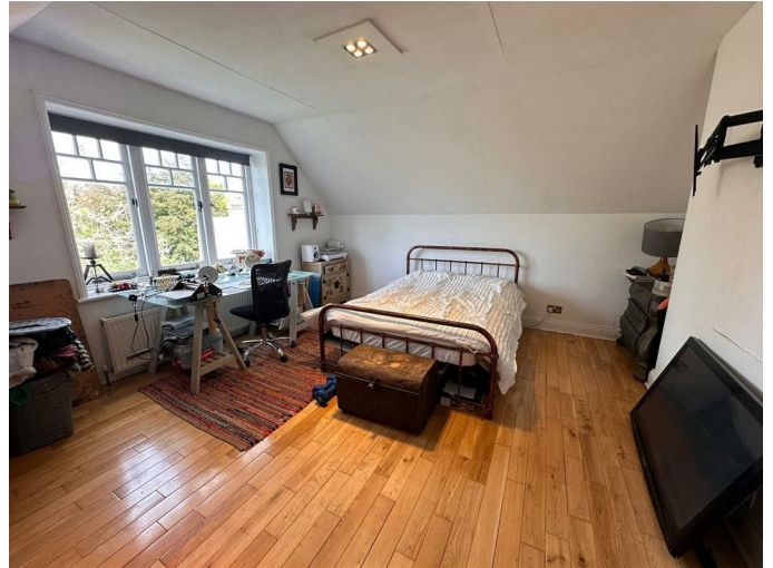
Bedroom Two 14'4 x 13'0 (4.37m x 3.96m)