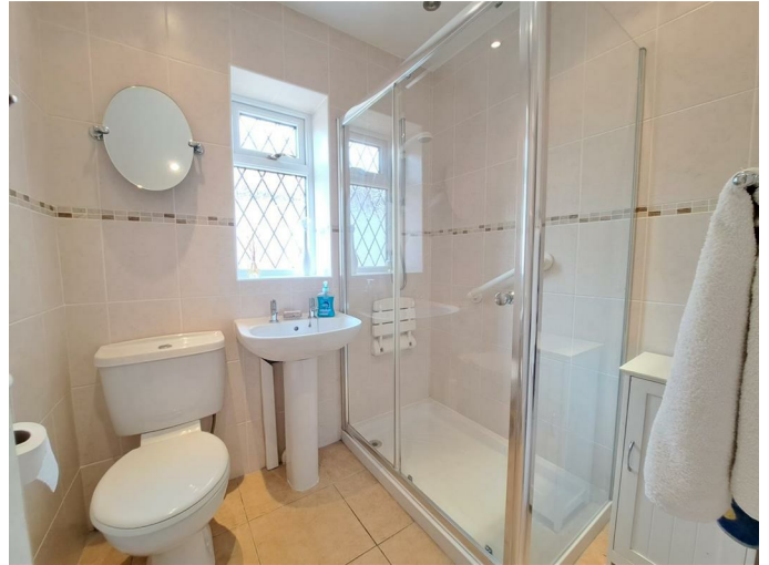
Shower Room 6'4 x 5'5 (1.93m x 1.65m )