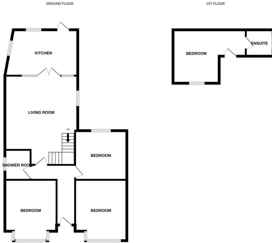
4 BEDROOM SEMI

Whilst every attempt has been made to ensure the accuracy of the floorplan contained here, measurements of doors, windows, rooms and any other items are approximate and no responsibility is taken for any error, omission or mis-statement. This plan is for illustrative purposes only and should be used as such by any prospective purchaser. The services, systems and appliances shown have not been tested and no guarantee as to their operability or efficiency can be given. Made with Metropix ©2024