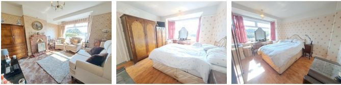
Bedroom Two 12'11 into bay x 11'0 (3.94m into bay x 3.35m)