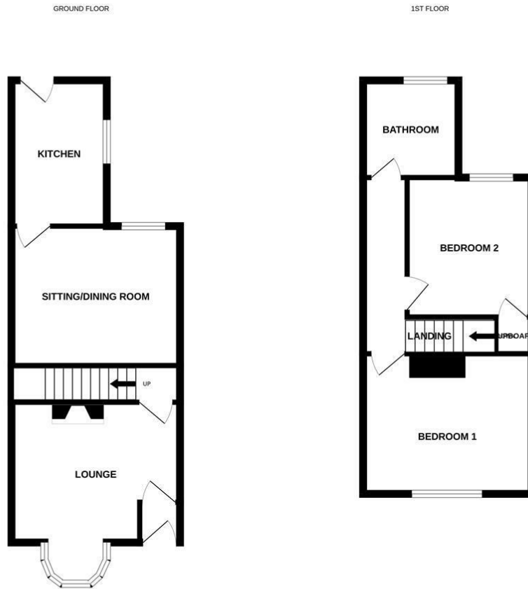
2 BEDROOM EOT COTTAGE

Whilst every attempt has been made to ensure the accuracy of the floorplan contained here, measurements of doors, windows, rooms and any other items are approximate and no responsibility is taken for any error, omission or mis-statement. This plan is for illustrative purposes only and should be used as such by any prospective purchaser. The services, systems and appliances shown have not been tested and no guarantee as to their operability or efficiency can be given. Made with Metropix CS24