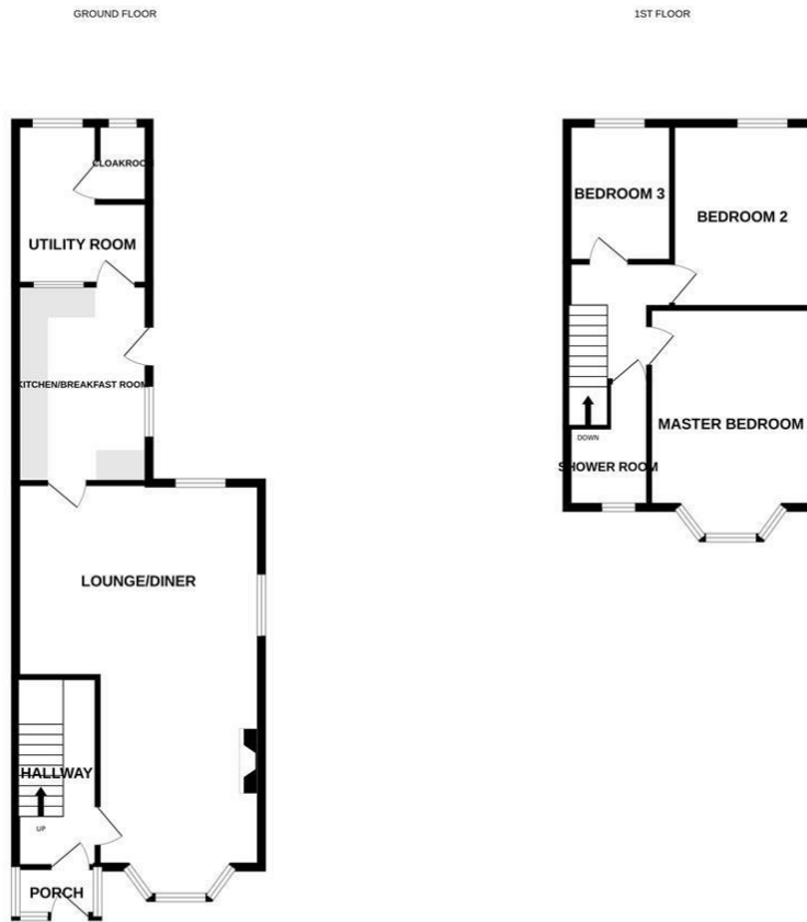
3 BEDROOM SEMI

Whilst every attempt has been made to ensure the accuracy of the floorplan contained herein, measurements of doors, windows, rooms and any other items are approximate and no responsibility is taken for any error, omission or mis-statement. This plan is for illustrative purposes only and should be used as such by any prospective purchaser. The services, systems and appliances shown have not been tested and no guarantee as to their operability or efficiency can be given. Made with Metropix ©2024