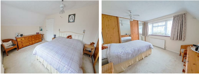
Bedroom Three 11'11 x 6'4 (3.35m x 1.93m)