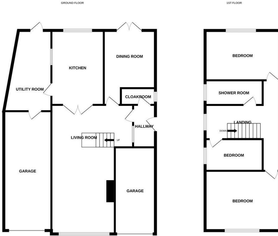
3 BED DETACHED

Whilst every attempt has been made to ensure the accuracy of the floorplan contained here, measurements of doors, windows, rooms and any other items are approximate and no responsibility is taken for any error, omission or mis-statement. This plan is for illustrative purposes only and should be used as such by any prospective purchaser. The services, systems and appliances shown have not been tested and no guarantee as to their operability or efficiency can be given. Made with Metropix ©2024