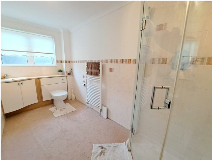
Shower Room 11'5 x 5'5 (3.48m x 1.65m)