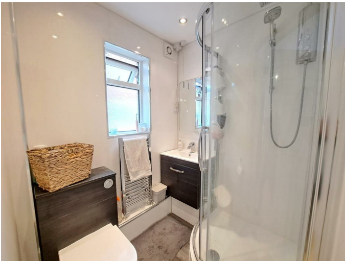
Shower Room 5'7 x 5'0 (1.70m x 1.52m)