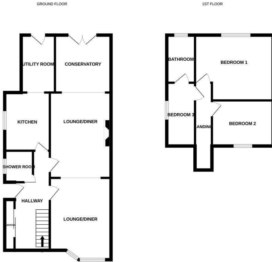
3 BEDROOM CHALET BUNGALOW

Whilst every attempt has been made to ensure the accuracy of the floorplan contained here, measurements of doors, windows, rooms and any other items are approximate and no responsibility is taken for any error, omission or mis-statement. This plan is for illustrative purposes only and should be used as such by any prospective purchaser. The services, systems and appliances shown have not been tested and no guarantee as to their operability or efficiency can be given. Made with Metropix ©2023