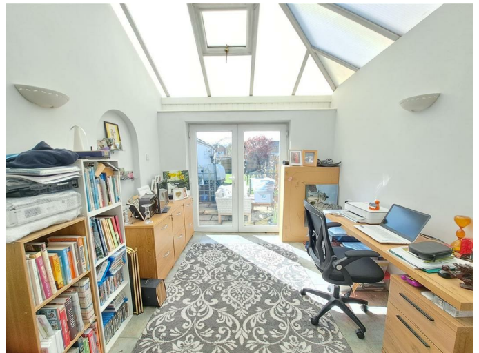
Conservatory 10'0 x 9'11 (3.05m x 3.02m)