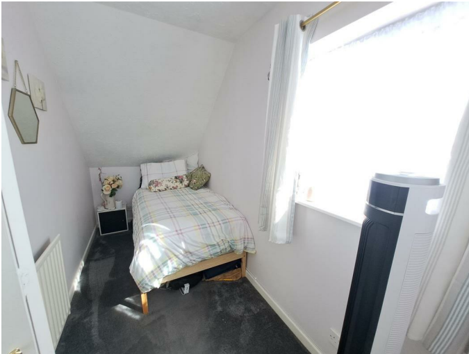
Bedroom Three 11'2 x 5'2 (3.40m x 1.57m)