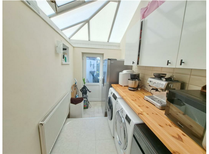
Utility Room 10'0 x 5'10 (3.05m x 1.78m)