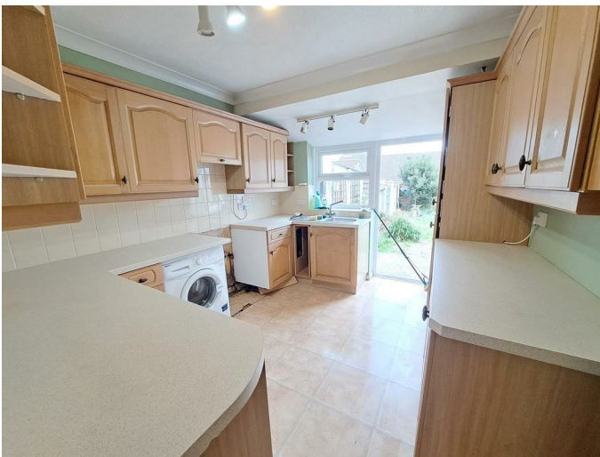
Kitchen 10'10 x 9'5 (3.30m x 2.87m)