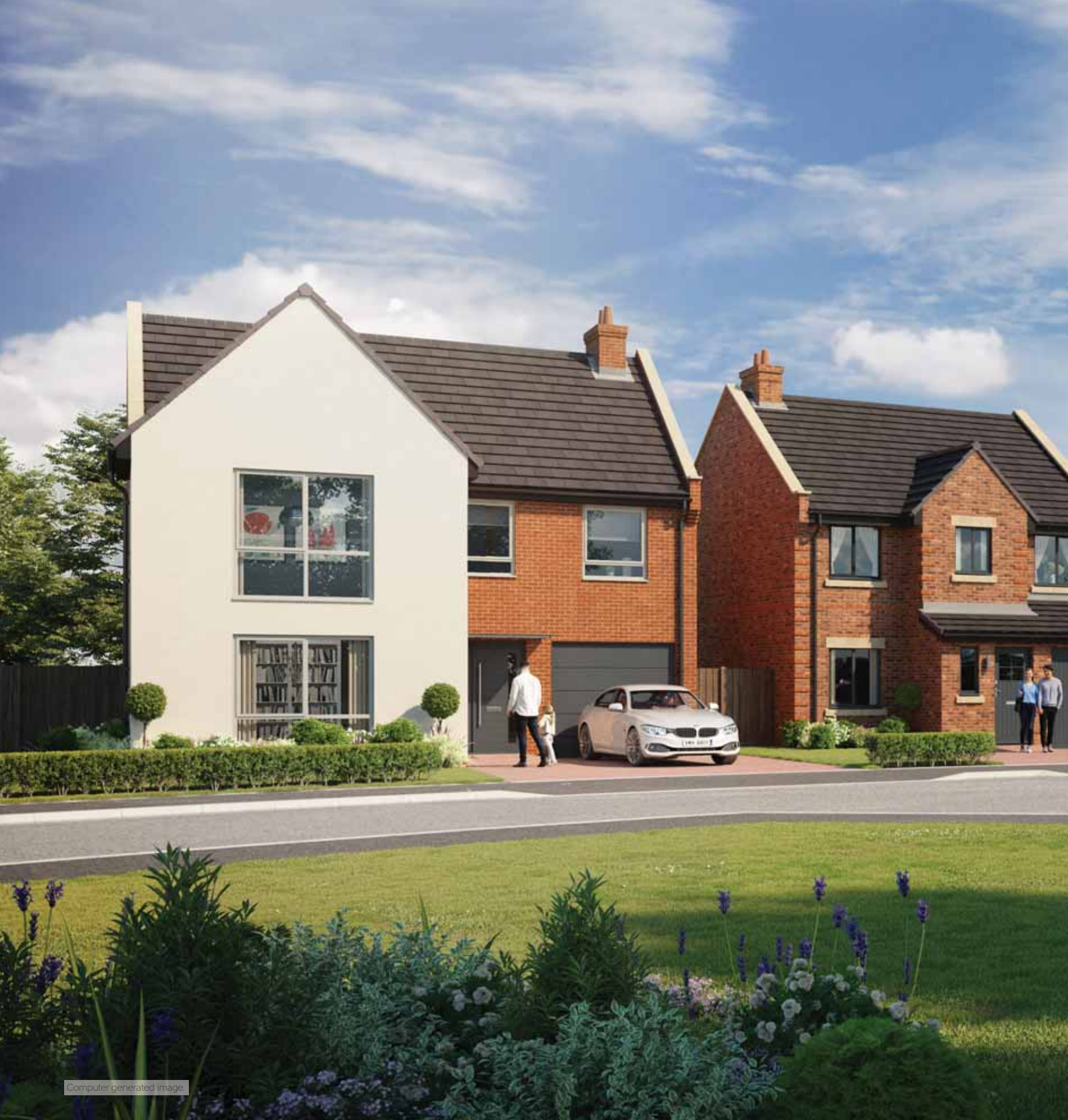
Computer generated image.