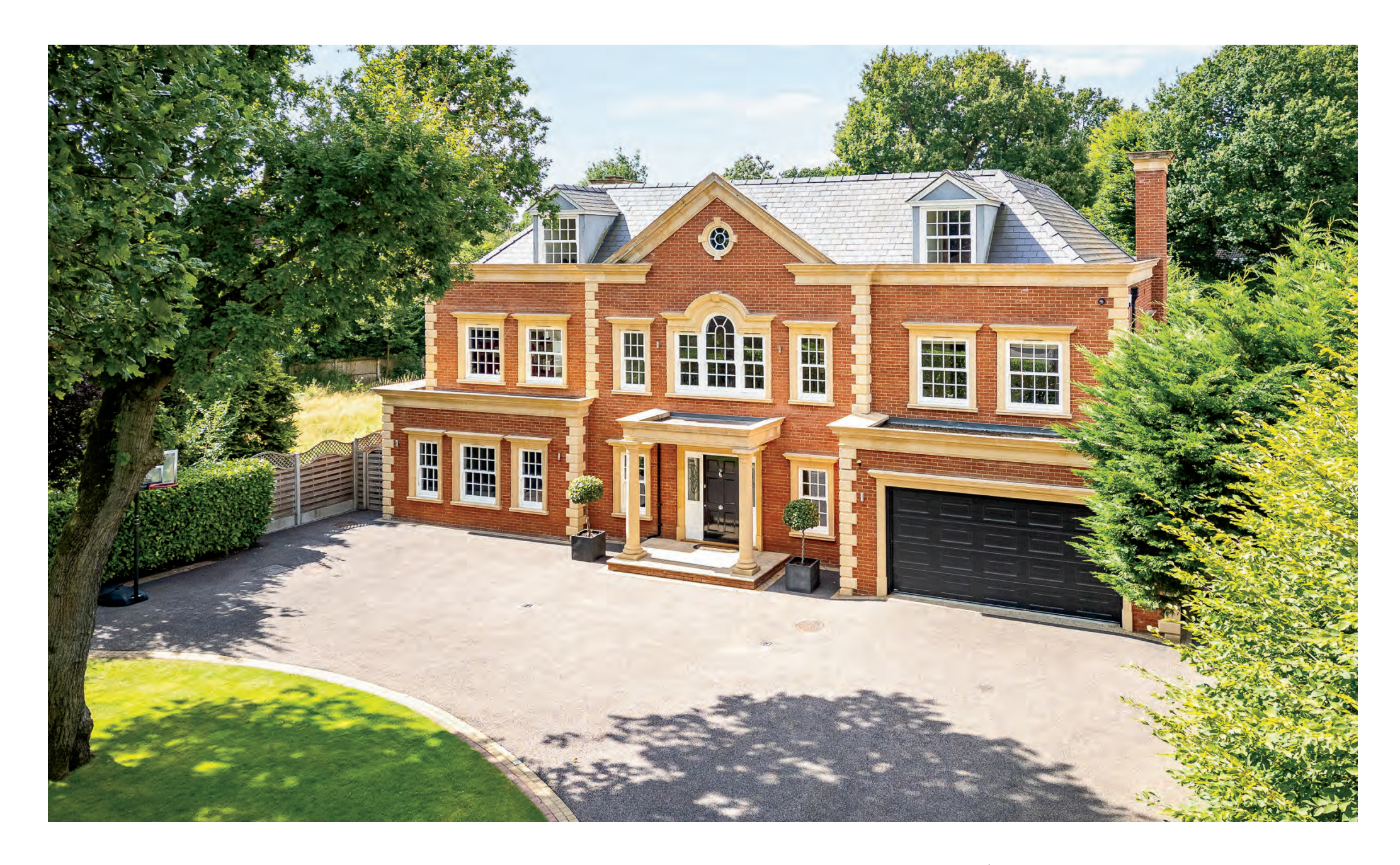
Highgrove Heronway | Hutton | Brentwood | Essex | CM13 2LX