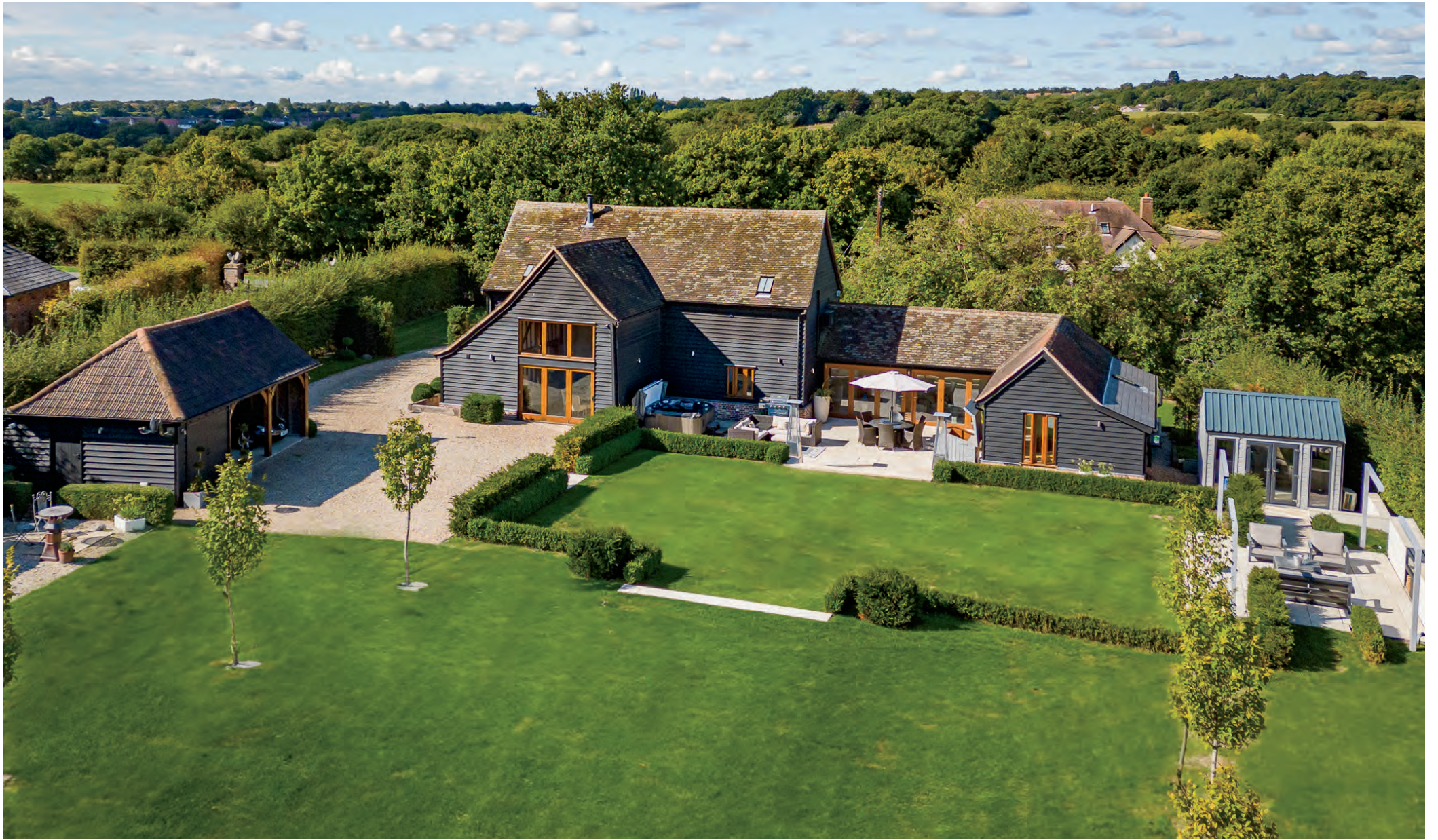
Oak Hill Barn Coxes Farm Road | Billericay | Essex | CM11 2UA